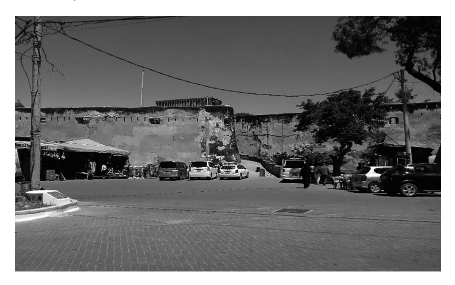
Figure 1. The entrance of Fort Jesus, Mombasa. The image was taken by the author on Sep 19, 2018.

army and the Portuguese forces were defeated again in Mombasa that the same year.<sup>30</sup>