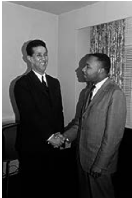
Figure 1. Algerian premier Ahmed Ben Bella (left) and Martin Luther King, Jr. (right), 1962.